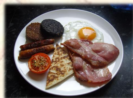
TRY OUR TRADITIONAL IRISH FRY!

All burgers are served with our fresh hand cut fries, a side salad may be substituted for an additional 3